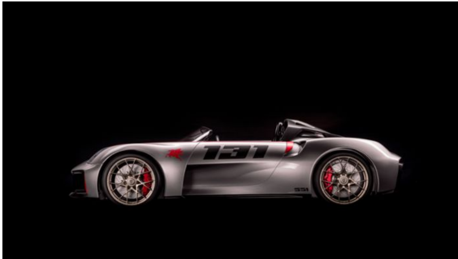
Porsche 904 Living Legend (2013)