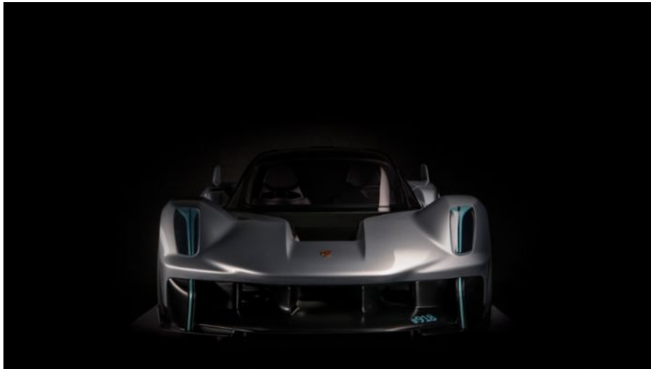
Porsche 906 Living Legend (2015)

For the "Unseen" series, Porsche has opened the gates to development centre's secret archives. In part one, the Newsroom presents six hypercars never before seen by the public.