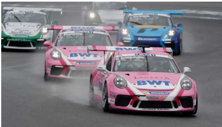
The qualifying on wet track