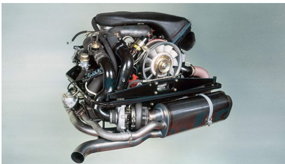
911 Turbo 3.3 (930)

The next step was taken in the 911 Turbo 3.6 (997) in 2006 with variable turbine geometry (VTG). It enables the charger to make optimum use of the energy contained in the exhaust gas. If a lot of exhaust gas flows toward the turbine—during high speeds on the freeway, for example—an electric guide opens the vanes in front of the turbine. Here, too, a lot of air means a lot of power. At lower rpm levels, by contrast, the vane angles reduce the cross-sectional area. The key is a sudden push on the gas pedal: the smaller the cross-sectional area, the faster the air flow, which means that the charger goes into operation considerably more quickly. Since variable turbine geometry was introduced, the torque curve for the turbo engine looks like a table mountain, with the peak quickly reached following a steep ascent.