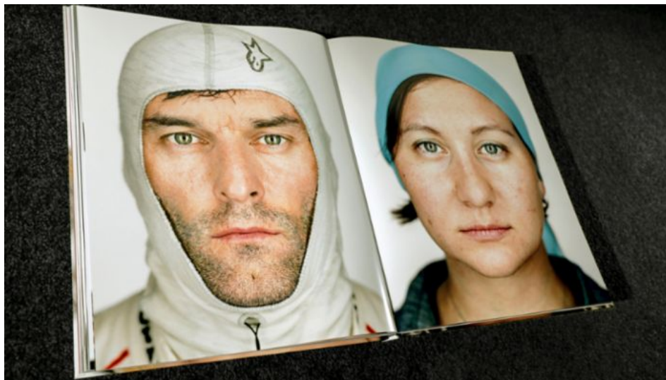
Near, nearer, Close : Mark Webber wearing a balaclava in Martin Schoeller's present photograph volume

One of the photographs from back then also made it into the new photograph volume Close . There is a portrait displayed in there of Porsche's brand ambassador, Mark Webber, from the 2016 photo session. The racing driver still has his balaclava on and is looking intently into the camera. This means Webber is displayed along with a series of other high-profile celebrities, such as Barack Obama, Taylor Swift and Lionel Messi.