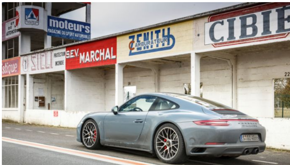
GTS = Getting To Stuttgart

Watch all extended episodes of the road trip on DriveTribe here .