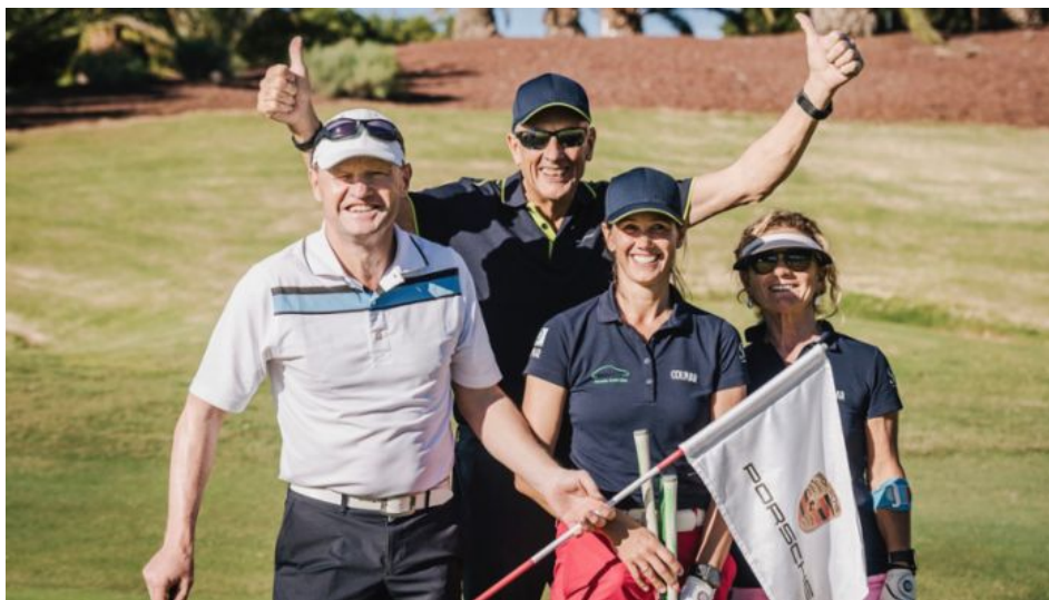
Hans-Joachim Stuck (second from left) was in Tenerife, too