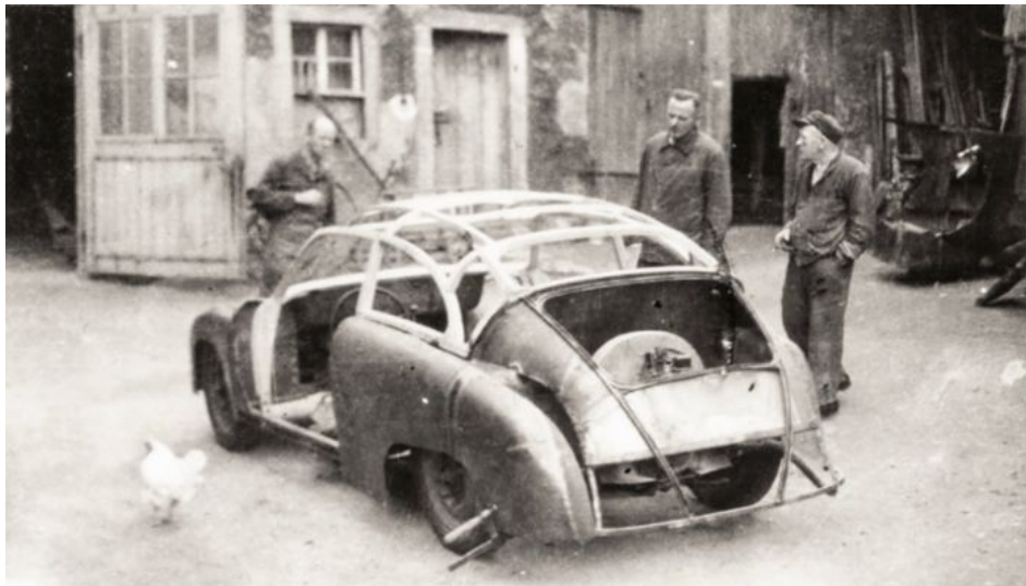
The first GDR Porsche in the courtyard of the Lindner body makers

At the heart of every Porsche lies its engine. Although it is pointless for the twins to try and obtain parts for a sports car in the GDR, they don't give up. On one of their first trips in their new car they travel directly to the Porsche plant in Zuffenhausen, where their Porsche replica is met with scepticism and a fair amount of ridicule due to its feeble engine.