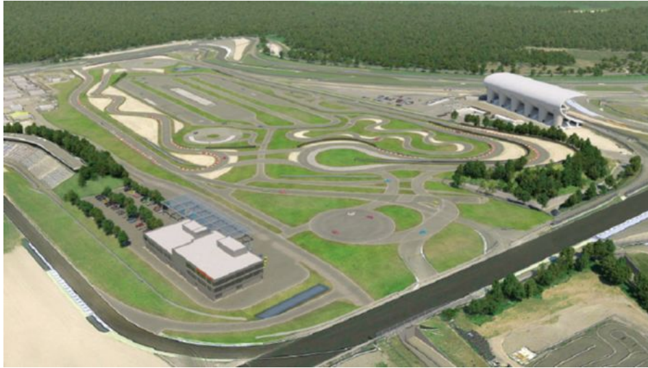
The Porsche Experience Centre will cover a total area of 160,000 square metres

The first Porsche Experience Centre opened on the factory grounds in Leipzig back in 2002. It was followed by Silverstone (UK, 2008), Atlanta (USA, 2015), Le Mans (France, 2015), and Los Angeles (USA, 2016). A new centre in Shanghai (China) was added in April 2018. The project at Hockenheimring will include multiple tracks and areas for a wide range of training programmes. A demanding 2.7-kilometre handling track will give drivers the chance to get to grips with vehicle dynamics. The track will be complemented by dynamic modules, such as water zones, a skid simulator and three roundabouts. A 5,200-square-metre off-road park containing 16 separate modules will comprise features typical of tricky off-road terrain, inclines of up to 70 percent, slopes, boulders, ditches, and tree trunks lying at different angles.