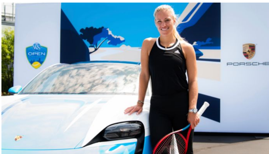
Angelique Kerber at the the WTA 1000 tournament in Cincinnati

The Porsche Team Germany member and three-time grand slam champion made it even more exciting against the Latvian Jelena Ostapenko (No. 30), the 2017 French Open winner. In the third set, she was 4-2 behind before digging deep to turn the match around and come out a 4-6, 6-2, 7-5 winner. "I've played lots and lots of close matches in my time and the experience definitely helped me against Jelena," said the Porsche Brand Ambassador after the encounter. "I had to battle all the time, stay calm after losing the first set and find my rhythm. In the end, I was playing my best tennis."