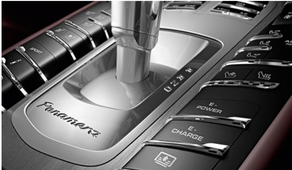
Panamera S E-Hybrid, center console, 2014, Porsche AG

The new Panamera S E-Hybrid offers three modes that can be selected by pushbuttons on the centre console. The E-Power mode enables largely all-electric driving. When E-Power is deactivated, the operating strategy switches to Hybrid mode. This causes the momentary charge state of the high-voltage battery to be essentially frozen to conserve electric driving range for the next stage through a city. Moreover, the E-Charge mode can be used to efficiently charge the high-voltage battery during the drive. Rounding out the driver's options is the Sport mode for typical Porsche high performance and a special sporty characteristic with more direct handling.