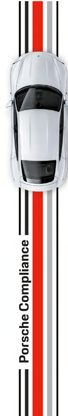
Photo Credits Cover: Porsche Page 4, 7, 8, 12, 15, 16, 19, 20, 23, 25, 27, 29, 30, 33, 34, 37, 39: Porsche Page 11: NASA Page 27: Hannah Busing on unsplash Page 33: Scott Graham on unsplash