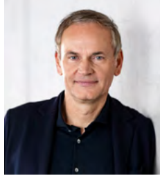
Oliver Blume Chairman of the Executive Board